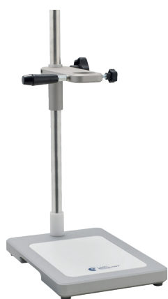
Laboratory stand in option