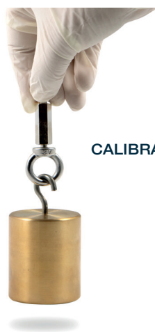
CALIBRATION KIT (p57)